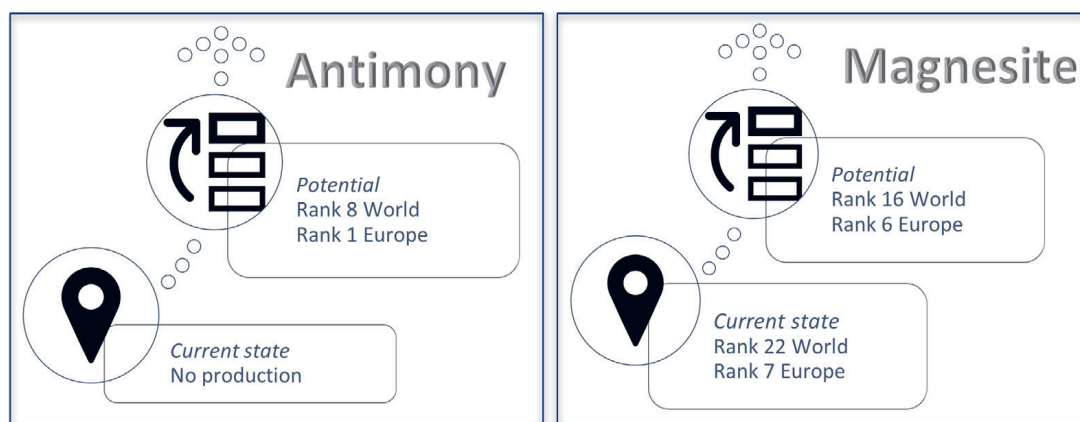
Figure 4a (left). Utilizing Bosnia-Herzegovina's potential for antimony production; b (right). Utilizing Bosnia-Herzegovina's potential for magnesite.

not be neglected in the extraction of useful components from ore. Within the Borovica-Vareš-Čevljanovići-Srednje ore zone, the Rupice and Veovača deposits are classified as prospective deposits containing economic ore reserves (KUBAT, 1982; 1995). Geological exploration is currently ongoing.