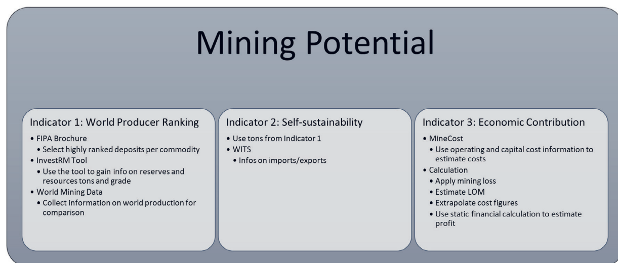
Figure 3. Data sources and processes used to calculate indicators of mining potential (Copyright of original data used from World integrated Trade Solutions (WITS) belong to the World Trade Organization (WTO). Conclusions and analyzes based on this data are the responsibility of the authors and do not necessarily represent the opinion of the WTO. LOM = Life Of Mine)

The exploration potential was estimated based on the geological setting of the wider area around an occurrence and the available data from previous exploration campaigns regarding the level of