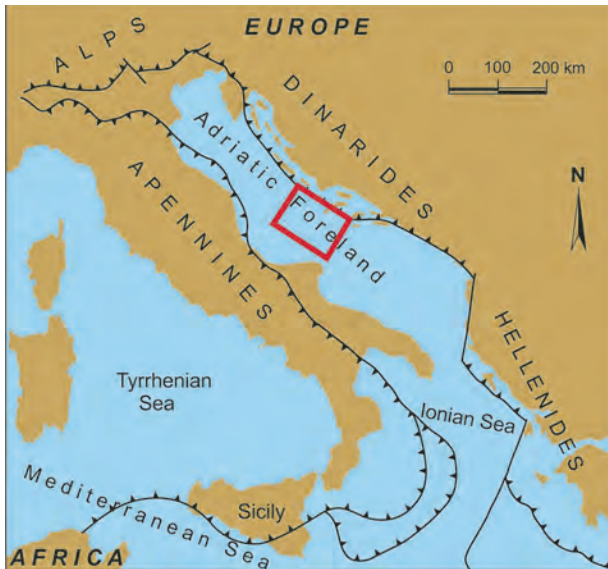
Slika 1. Pregledna geotektonska karta s označenim područjem planiranih istraživanja (crveni okvir)

aju interpretirati najnoviji 2D seizmički profili odobreni od strane Agencije za ugljikovodike (AZU), reinterpretirati gravimetrijski podatci, definirati glavni rasjedi te 3D modelirati geometrija odabranih solnih struktura. Strukturno-tektonski sklop (re)definirat će se na pučinskim otocima srednjeg Jadrana (slika 1). Uspoređivanjem prostornog rasporeda epicentara i hipocentara zabilježenih potresa s interpretiranim geološkim strukturama, pokušat će se razjasniti povezanost aktivne tektonike sa solnim strukturama. Istraživanjem i datiranjem najmlađih (kvartarnih) naslaga pokušat će se definirati neotektonska aktivnost solnih dijapira. Istraživanjem odabranih markantnih (sub)recentnih erozijskih oblika nastojat će se procijeniti prošla i buduća seizmotektonska aktivnost i seizmogeohazardi.