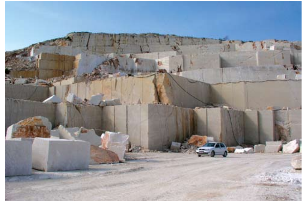
Figure 3: Quarry Sivic on island Brač in Croatia (dolomitized limestone).

To improve criterion for evaluation of analytical results, a standard or basic tectonic fabric curve was constructed, i.e. square parabola. The analysis point out exceptionally