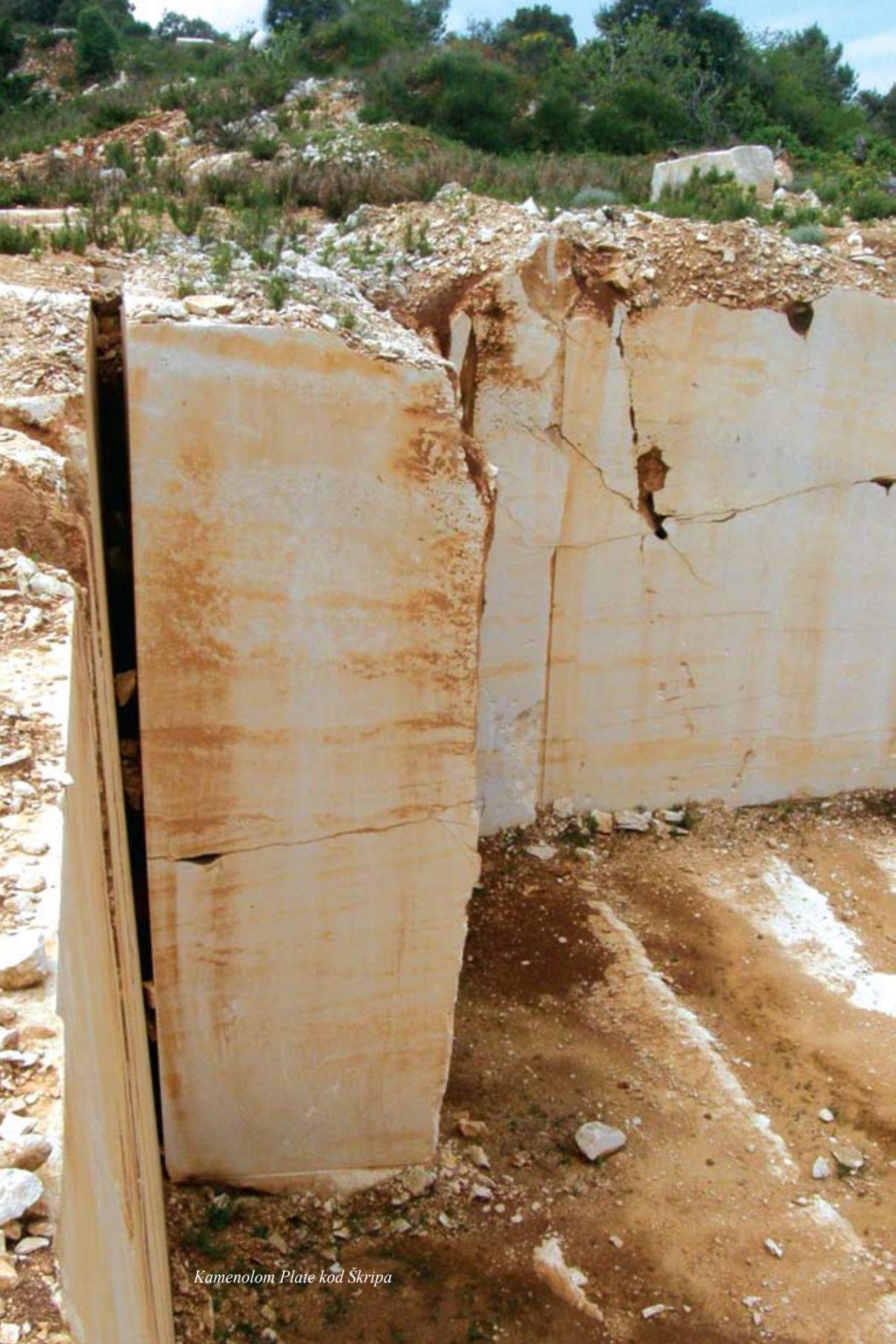
Kamenolom Plate kod Škripa