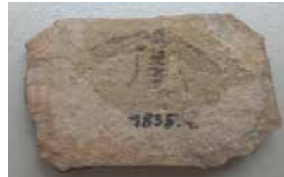
Figure 6: Geological samples from Radoboj: (left) sulphur in marl – finding of König Friedrich August II von Sachsen in 1845 (Min 20650 Sy, Senckenberg Naturhistorische Sammlungen, Museum für Mineralogie und Geologie, Photo: Jana Wazeck); (middle) vine leaf – Vitis teutonica (photo from archive of Radboa museum); (right) plant fly – Bibio giganteus (photo from archive of Radboa museum).