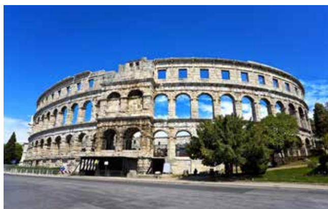
Figure 3: (left) Vinkuran, the oldest quarry in Istria; (right) the Arena in Pula.

sequence (Tišljar et al. , 1995). Today the quarry is used as a venue for concerts and other performances and as an open-air monument of mining activity. Industrial heritage from the Roman period is presented by visible chisel marks.