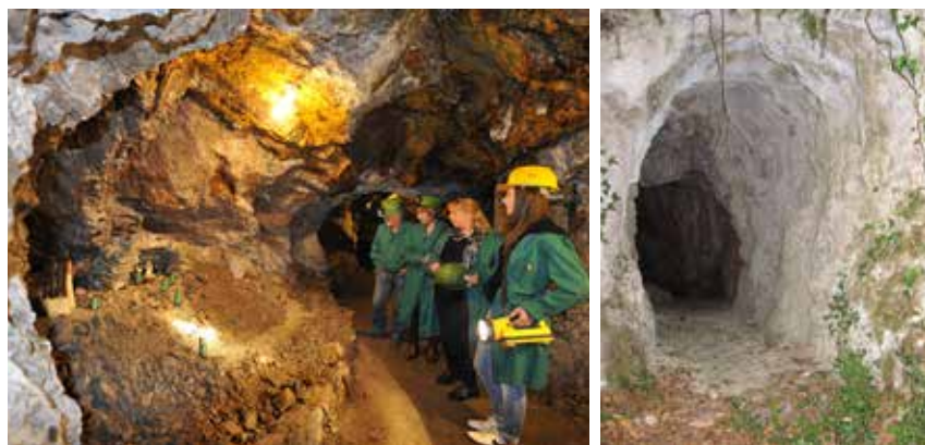
Figure 5: (left) Copper mine Rude; (right) underground mine of pyritised bauxites Minjera.

geo-heritage value. Proper protection of outcrops inside the mine and on the surface is very important. Other metallic ore mines not to be omitted are Zrinski (partly restored and maintained by Nature Park Medvednica), Kraševi Zviri (a zinc mine suitable for restoration and with a local community interested in preservation), and Trgovska gora (a mining area highly significant in Croatian history).