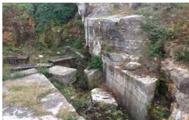
Figure 2: Quarries declared natural geological monuments: (left) Rupnica; (right) Fantazija.