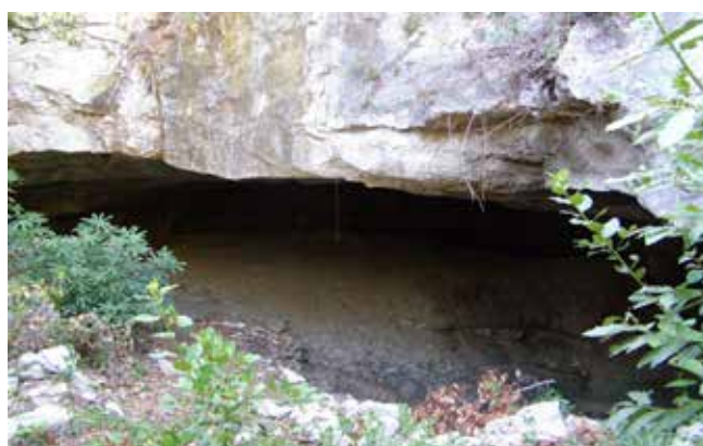
Figure 4: (left) Vrnik islet with old abandoned quarries; (right) underground natural stone quarry at Sutvara islet.