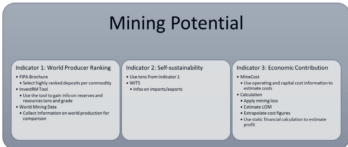
Figure 3. Data sources and processes used to calculate indicators of mining potential (Copyright of original data used from World Integrated Trade Solutions (WITS) belong to the World Trade Organization (WTO). Conclusions and analyzes based on this data are the responsibility of the authors and do not necessarily represent the opinion of the WTO. LOM = Life Of Mine)

The exploration potential was estimated based on the geological setting of the wider area around an occurrence and the available data from previous exploration campaigns regarding the level of