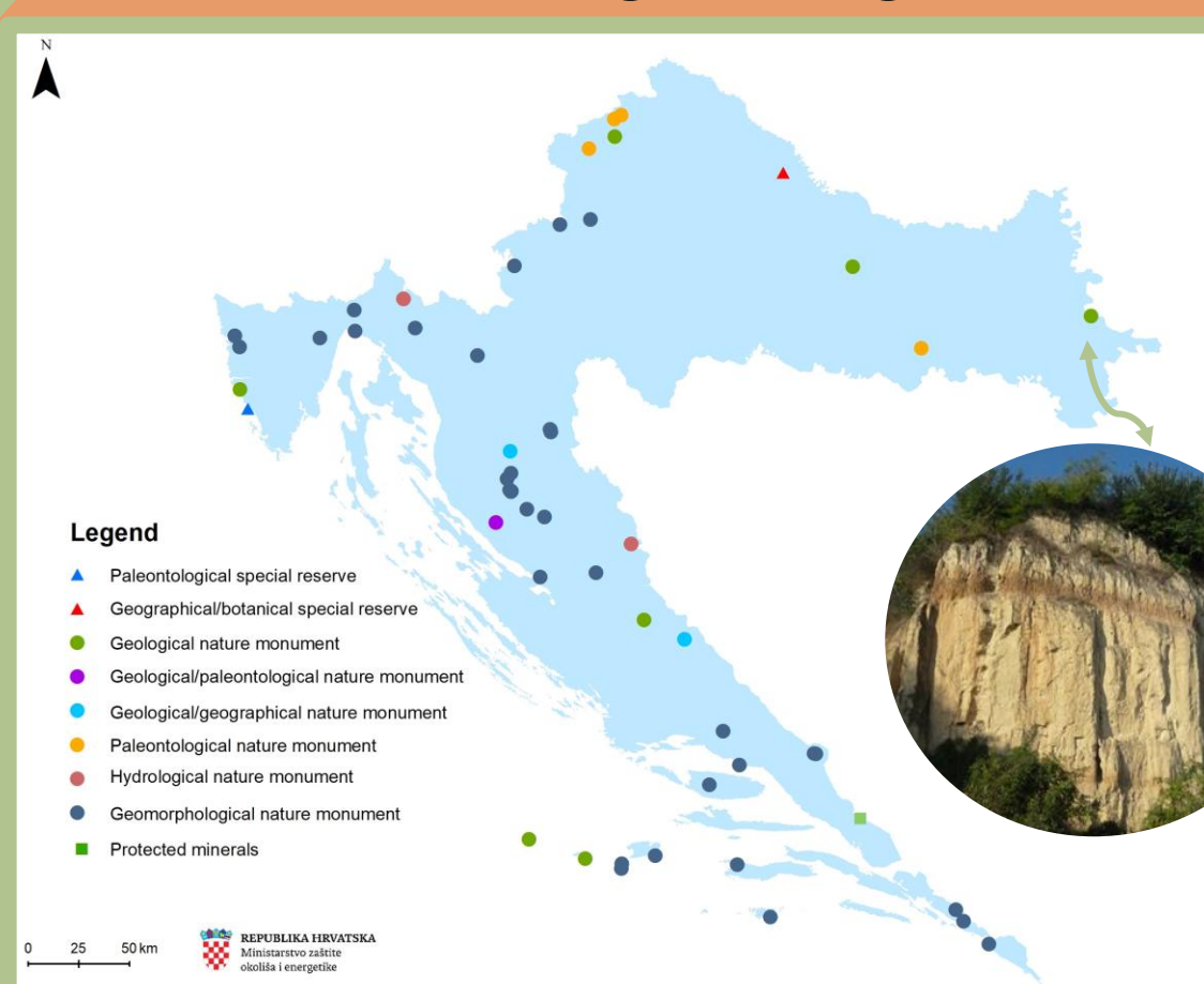
“Gorjanović loess section” – cca 30 m high loess–palaeosol sequence exposed along the Danube in Vukovar is only geological monument partly related to soil.