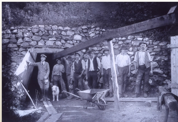
Miners in front of a mine in Rude Rudari ispred rudnika u Rudama

here. The master Andrija Pribila (later also the mining judge) wrote the first description of the mine in 1785. Following the reorganization of mining in the Austro-Hungarian Monarchy, the Mining Substitution Court was established in Samobor in 1788. The court primarily dealt with mining rights and their implementation. The mine in Rude was one of the largest copper mines in Austro-Hungarian Monarchy. The last owners of Rude were Franz Reizer and later on, in 1926, Mavro Bernstein. The mine was closed in the middle of the last century. The revitalization began in 2002, and in 2012 it was opened for tourists.