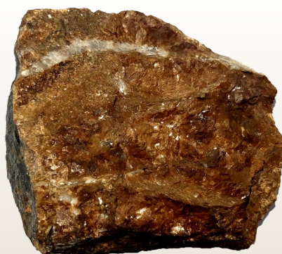
Iron ore – siderite Ruda željeza – siderit

Other minerals such as gypsum, galena, quartz, barite, pyrite, sphalerite, and goethite also appear in the deposit. Gypsum can vary from white, grey, green to red, and it has been mined for a short period of time. It is usually accompanied by a very similar mineral called anhydrite.