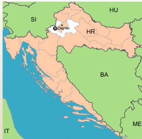
The location of Rude Položaj Ruda

The St. Barbara Mine has been a part of the Register of Cultural Heritage of the Republic of Croatia since 2015 – and it can be found on the list of protected cultural properties.