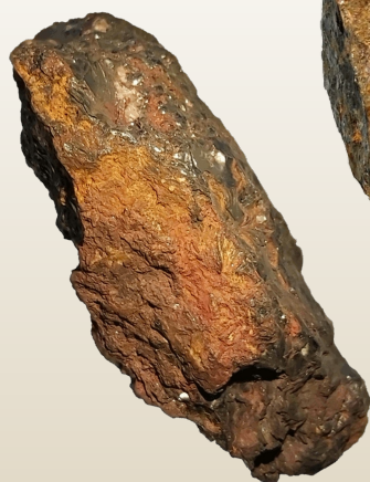
Iron ore – hematite Ruda željeza – hematit