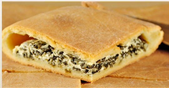
Miner's Cake Rudarska greblica

An important part of Rude's cultural heritage is the salty cheese and walnut cake called Rudarska greblica (Miner's cake). This cake was once the main meal of miners. In the end of 2007, the cake was declared an intangible cultural heritage of the Republic of Croatia. The event called "Miners Cake's Day" has been held regularly since 1985 on the first weekend of July. As part of the event, a competition in baking the best cake is organized.