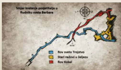
The map of revitalized St. Barbara mine / Mapa revitaliziranih rovova u Rudniku sveta Barbara

Obilazak 350 m rudnika traje oko četrdeset minuta, a temperatura je konstantno oko 11 °C. Rudnik je za posjetitelje otvoren od 21. ožujka do 4. prosinca vikendom, blagdanima i praznicima od 10 do 18 h. Zaštitna oprema je za svakog osigurana te se rudnik posjećuje isključivo uz stručno vodstvo. Za više informacija o rudniku pogledajte http://www.rudnik.hr/hr/ .