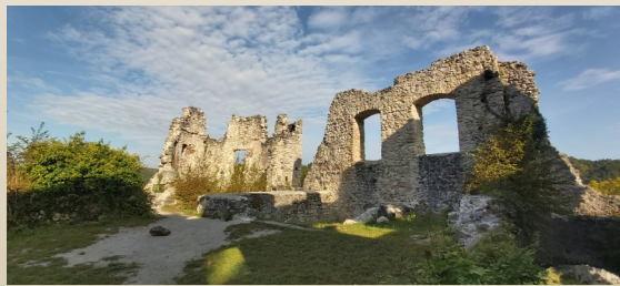
The old city of Samobor / Stari grad Samobor