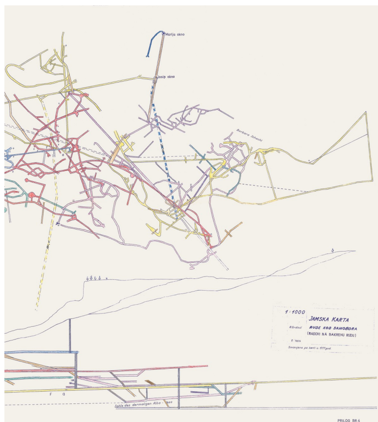
Underground map of the St. Barbara Mine / Jamska karta Rudnika sveta Barbara

astonishing branching of mining corridors and the ground plan of mining facilities such as: “ mining smithy, desulphurization furnace, smelter, ore screening building, large building for the same purpose, below the flow of ore roasting buildings can be found and finally the chapel of St. Anthony with a vestibule accessible from three sides is marked. ” [3].