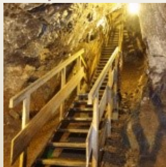
Mine interior Unutrašnjost rudnika