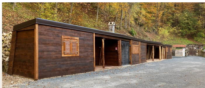
Mining trench simulation Simulacija rudarskog rova

The tour of 350 m of mine shafts takes about forty minutes. The temperature is constantly about 11 °C. The mine is open to visitors from March 21 st to December 4 th on weekends, holidays and public holidays from 10 a.m. to 6 p.m. Protective equipment is provided for everyone and the mine can be visited only with a tour guide. For more information about St. Barbara Mine please visit http://www.rudnik.hr/en/ .