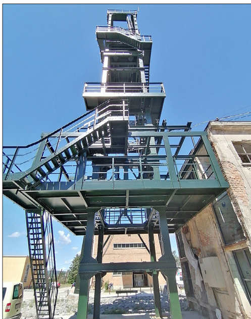
Figure 7: Mine shaft in Labin

Coal mining in Istria ceased in the early 1990s. The local community still has a strong memory of this industry, and many of its historical artefacts have remained on the peninsula. Some towns like Labin (see Figure 7 ) are heavily marked by them.