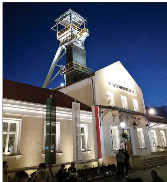
Figure 1: Salt mine entrance in Wieliczka (by Briševac, Z.)

There are many examples of the successful conservation and revitalization of mining heritage sites in the European Union. In some classical cases, old mines formerly used for the extraction of salt have been revitalized. Traditionally, this is the case of Salzburg or the famous Wieliczka salzmine near Krakow (see Figure 1). Wieliczka is the most popular visitor mines in the world and one of the most visited tourist attractions in Poland. It is marked as the first of the mining objects and regions in the world on the UNESCO World Heritage List (URL1). Comparing the number of visitors, it ranks higher than the Austrian Hallstatt, which is probably the oldest salt mine in the world. The history of salt mining dates back to the Middle Bronze Age and it is related to the Swedish Falun (which once belonged to the most im-