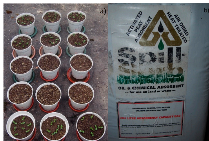
Figure 2. (a) Experimental set up. Picture taken at the end of the study (153 days); (b) bioremediation treatment, Spill-Sorb.

On 24 October 2018, soil was sampled from the contaminated area. On the same day, soil samples were also collected nearby that were not affected by the oil spill (control). The main focus was to conduct experiments and soil analysis in a controlled area to observe the effect of the bioremediation treatments. For this purpose, two days later, an experiment was set up in triplicate in the greenhouse of the University of Zagreb Faculty of Agriculture (Figure 2a). The sub-samples for soil chemical analysis were taken at the beginning of the experiment (2 days) and then after 10, 50, and 153 days.