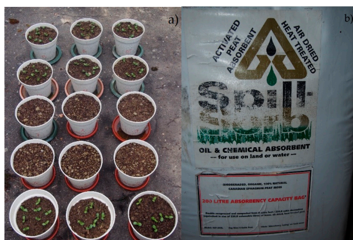
Figure 2. (a) Experimental set up. Picture taken at the end of the study (153 days); (b) bioremediation treatment, Spill-Sorb.

On 24 October 2018, soil was sampled from the contaminated area. On the same day, soil samples were also collected nearby that were not affected by the oil spill (control). The main focus was to conduct experiments and soil analysis in a controlled area to observe the effect of the bioremediation treatments. For this purpose, two days later, an experiment was set up in triplicate in the greenhouse of the University of Zagreb Faculty of Agriculture (Figure 2a). The sub-samples for soil chemical analysis were taken at the beginning of the experiment (2 days) and then after 10, 50, and 153 days.