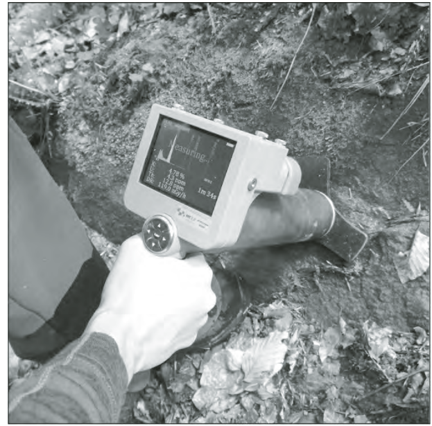
Figure 1. Field measurements with gamma Surveyor Vario