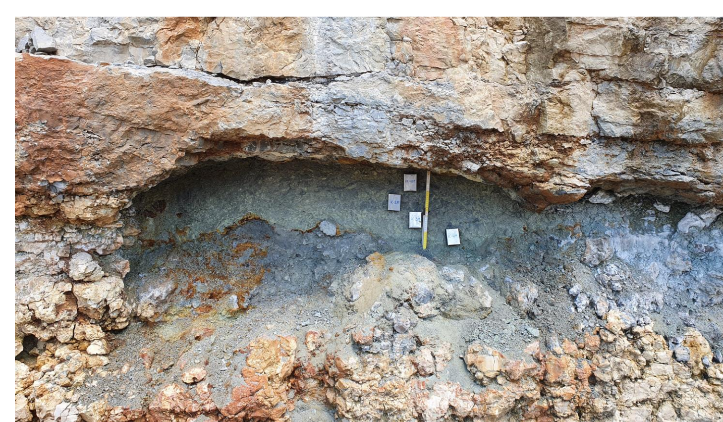
Fig. 4. Profile of greenish-grey clay in Kanfanar quarry with Kubiena boxes.