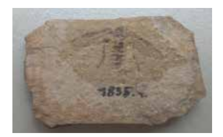
Figure 6: Geological samples from Radoboj: (left) sulphur in marl – finding of König Friedrich August II von Sachsen in 1845 (Min 20650 Sy, Senckenberg Naturhistorische Sammlungen, Museum für Mineralogie und Geologie, Photo: Jana Wazeck); (middle) vine leaf – Vitis teutonica (photo from archive of Radboa museum); (right) plant fly – Bibio giganteus (photo from archive of Radboa museum).