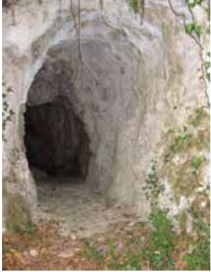
Figure 5: (left) Copper mine Rude; (right) underground mine of pyritised bauxites Minjera.

geo-heritage value. Proper protection of outcrops inside the mine and on the surface is very important. Other metallic ore mines not to be omitted are Zrinski (partly restored and maintained by Nature Park Medvednica), Kraševi Zviri (a zinc mine suitable for restoration and with a local community interested in preservation), and Trgovska gora (a mining area highly significant in Croatian history).