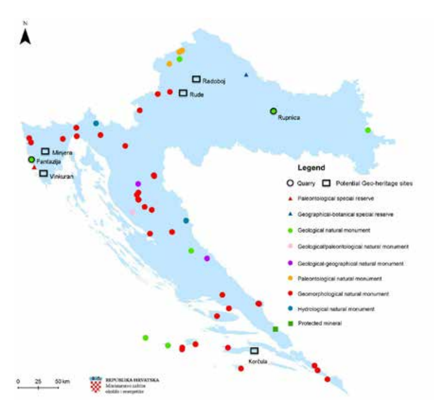
Figure 1: Locations of protected geo-heritage sites in Croatia (after MZOE, 2019) and mine heritage sites (not legally protected) mentioned in this article.

fabric, load casts and microcasts, desiccation cracks, shrinkage cracks, sand-watch structures, supratidal breccia, tide channels, erosional surfaces, etc.) (Tišljar et al., 1995). Although both sites are protected by law and arranged for visitors, Rupnica is very well maintained thanks to Geopark Papuk, while Fantazija is neglected and even covered with graffiti. The legal basis in Croatia is finally favourable for conservation of our geological heritage, but physical protection is questionable (Marjanac, 2012).