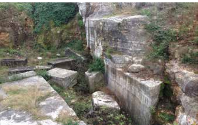
Figure 2: Quarries declared natural geological monuments: (left) Rupnica; (right) Fantazija.