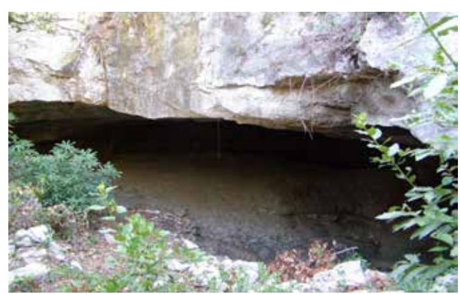
Figure 4: (left) Vrnik islet with old abandoned quarries; (right) underground natural stone quarry at Sutvara islet.