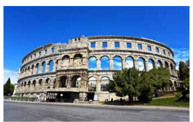
Figure 3: (left) Vinkuran, the oldest quarry in Istria; (right) the Arena in Pula.

sequence (Tišljar et al. , 1995). Today the quarry is used as a venue for concerts and other performances and as an open-air monument of mining activity. Industrial heritage from the Roman period is presented by visible chisel marks.